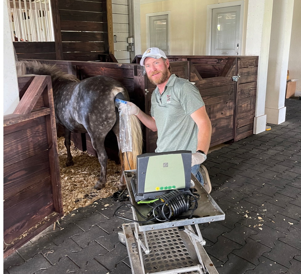
PBEC can manage your mare through the breeding and reproduction process.

The Reproduction and Fertility team at Palm Beach Equine Clinic is ready to leverage its expert care and advanced practices to produce the talent of the future. To learn more about the routine and advanced reproductive services offered this season, contact Palm Beach Equine Clinic at 561-793-1599 or visit www.EquineClinic.com .