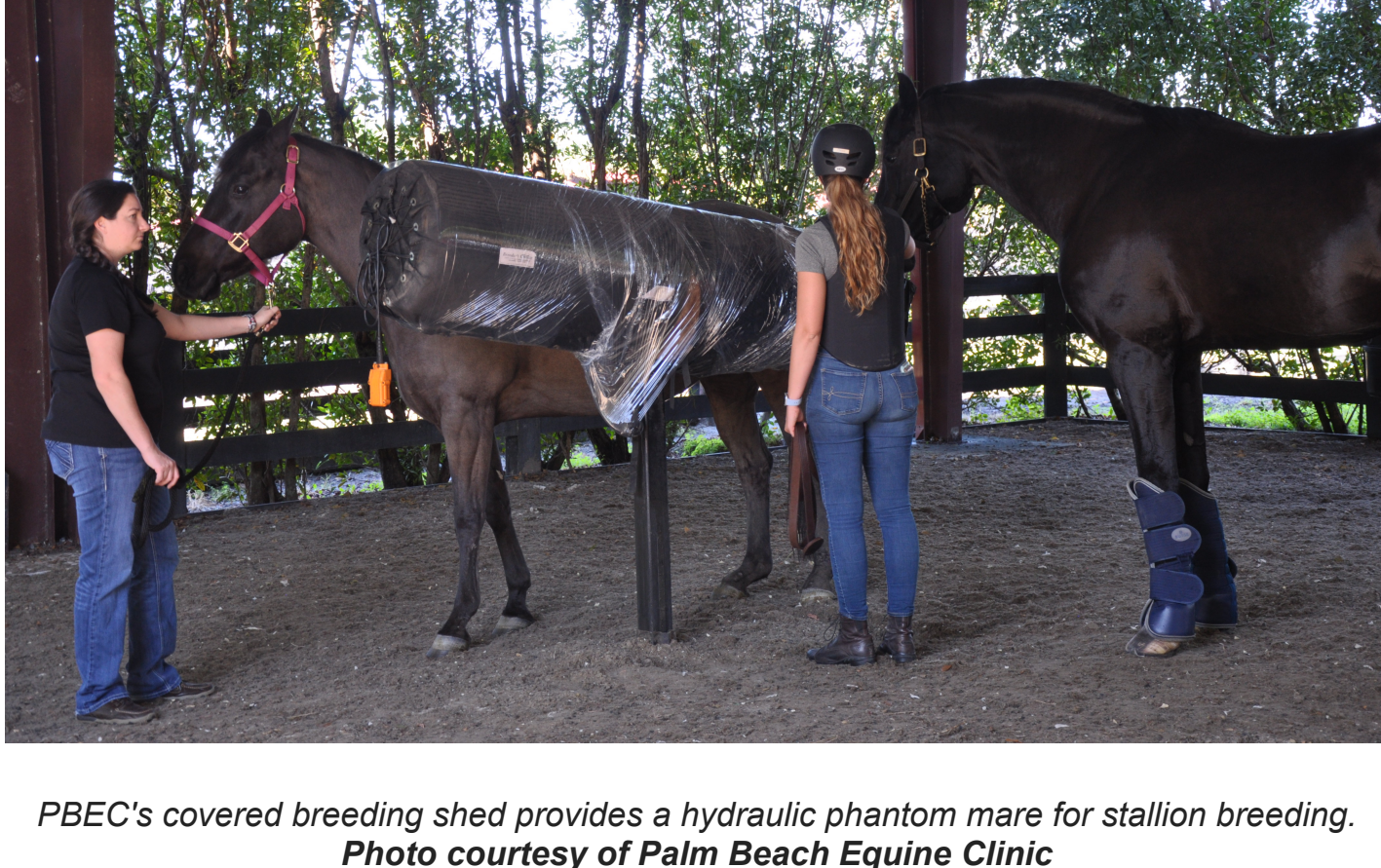
PBEC's covered breeding shed provides a hydraulic phantom mare for stallion breeding.