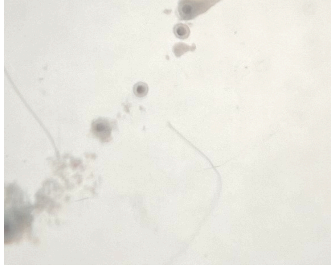
A microscope image showing oocytes following a TVA procedure at Palm Beach Equine Clinic.